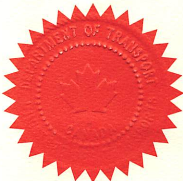
Sorin Camer For Minister of Transport

Conditions: The installation of the approved part is to be limited only to the type / model of aeronautical product(s) listed above